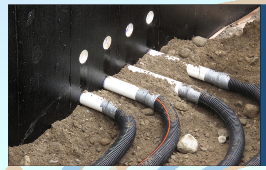
Figure 3. Watertight connection of tubes to a building Photo courtesy of Trevor Butler.

© Her Majesty the Queen in Right of Canada, as represented by the Minister of Natural Resources, 2021