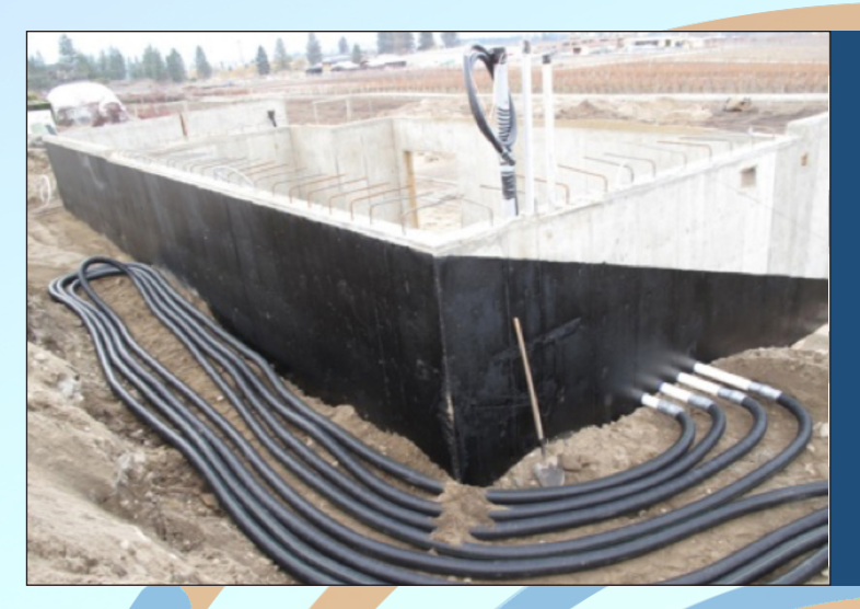
Figure 1. The layout of tubes with lower layer already backfilled