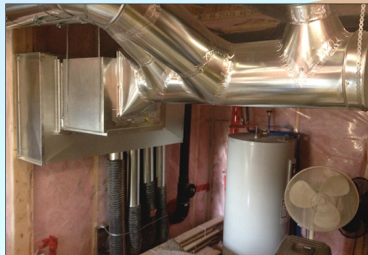
Figure 1. Layout of tubes connected to a supply fan and ducting