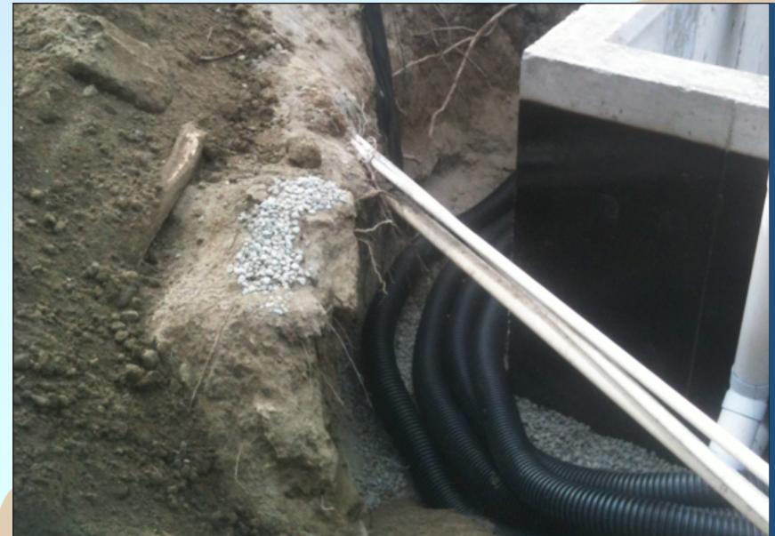
Figure 3. Pipes in a trench before it is backfilled

© Her Majesty the Queen in Right of Canada, as represented by the Minister of Natural Resources, 2021