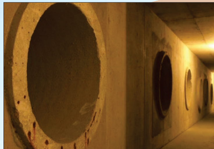
Figure 2. Culvert showing the pipes' inlets

© Her Majesty the Queen in Right of Canada, as represented by the Minister of Natural Resources, 2021