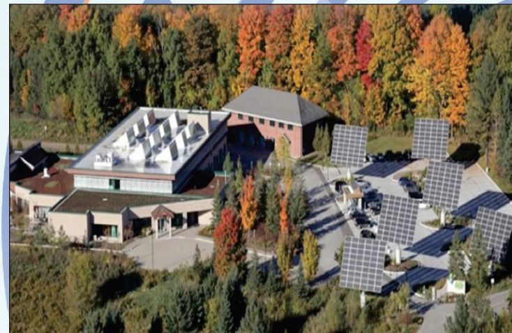
Figure 1. Earth Rangers Centre for Sustainable Technology, Woodbridge, Ontario