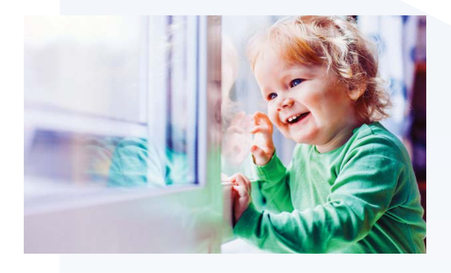
Find out what energy efficiency programs are available near you at www.nrcan.gc.ca/energy/funding/efficiency/4947.

While high-performance windows ultimately pay for themselves in energy savings, incentives like Hydro-Québec's rental properties program have helped property owners get over the hump of an upfront investment. The two-year program (which concluded in 2016) covered about half of the average cost difference between ENERGY STAR certified and conventional windows, enabling building owners to make meaningful efficiency upgrades. 19 With lower energy costs, improved comfort, and a quieter space to live or work, tenants are the program's biggest winners.